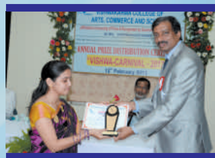
Best Teacher of the Year