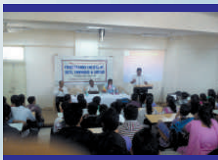
Workshop on Disaster mgmt.