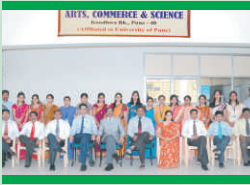
Principal with Staff