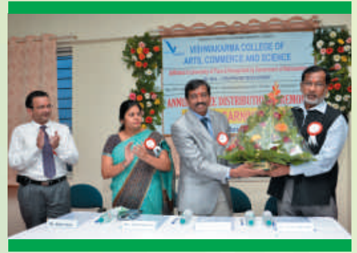
Principal with Chief Guest