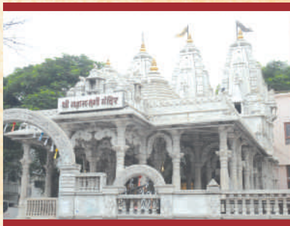
MAHALAXMI TEMPLE, SARASBAUG, PUNE

Bansilal Ramnath Agarwal Charitable Trust, Pune, runs Vishwakarma College of Arts, Science & Commerce. The Trust was established on 16 June 1975 under Bombay Trust Act of 1950. The Trust undertakes educational, religious and social activities.