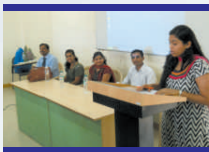
Pre - Placement Talk with TCS