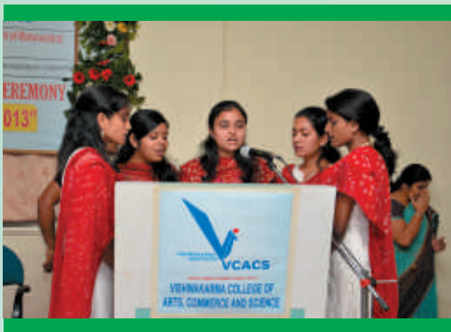
Wel - Come Song