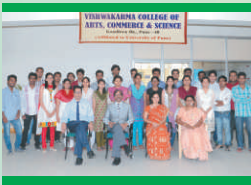
Best Class of the Year