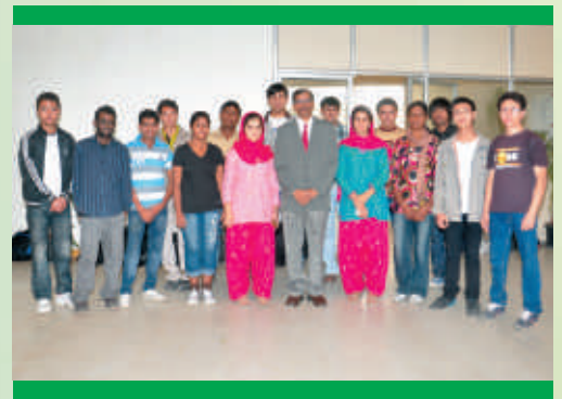
Principal with Foreign Students