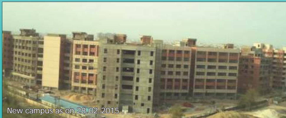
New campus as on 28.02.2015