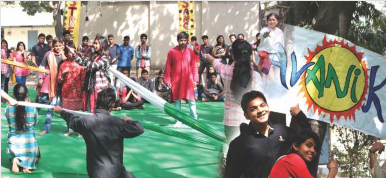
DDUC compliments academic component of the university and enhances the overall educational experience of the students through a wide range of co-curricular programmes, services and activities.