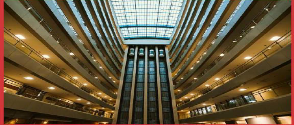
NMIMS Mumbai Campus