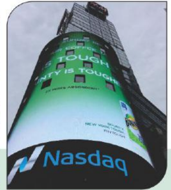
Nasdaq Head Quarter, New York