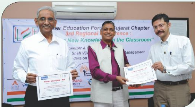
MoU signed with IIMA Alumni Association - Vadodara Chapter