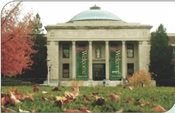
Cooperation with Marywood University, Scranton, Pennsylvania, USA (ACBSP Accredited) for 1+1 MBA (2nd year in USA) -2016