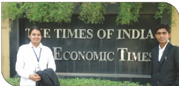
MBA Batch II (2010-2012)