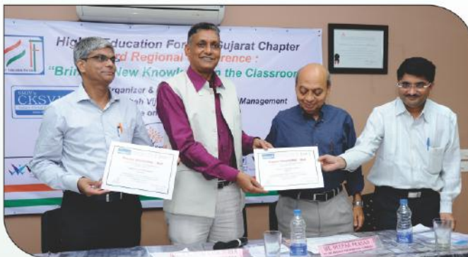
MoU signed with Vadodara Innovation Council (VIC).

During the HEF Gujarat Chapter's 3rd Regional Conference held on 31st October 2015, CKSVIM signed MoUs with the following industries: with Piramal Health Care Solutions, Indian Society for Training & Development, S K International, IIMA Alumni Association - Vadodara Chapter, Vadodara Innovation Council and Hindalco Industries Ltd. (A subsidiary of the Aditya Birla Group).