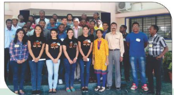
Interactive session : "International Students' Cross-Cultural Experiences in Learning" was organized by CKSVIM on February 28, 2015. Students from Rwanda, Uganda, Nepal, Burundi, Mozambique, Niger, Malawi, Afghanistan & Democratic Republic of Congo participated.