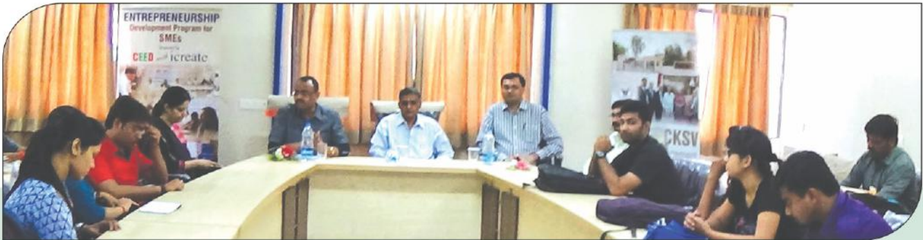
CKSVIM's Industry Institute Partnership Cell (IIPC) in association with Centre for Entrepreneurship & Enterprise Development (CEED) organized a Workshop on 'How to set up EXIM Enterprise' on 12th April 2014.