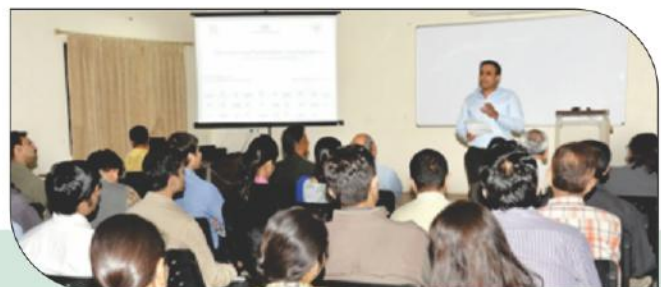
In January 2012, CKSVIM conducted the first program on Entrepreneurship Development Series with CII and CII-YI (Confederation of Indian Industry – Young India).