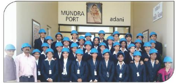
MBA Batch IV (2012-2014) & Batch V (2013-2015)