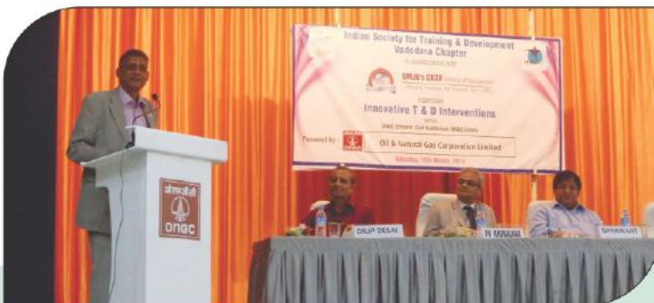
A one-day seminar was organized on 'T & D Interventions' with IIPC on 15th March 2014 at ONGC Auditorium.