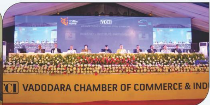
VCCI Expo 2014