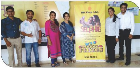
MBA Batch VII (2015-2017)