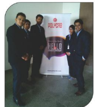
MBA Batch V (2013-2015)