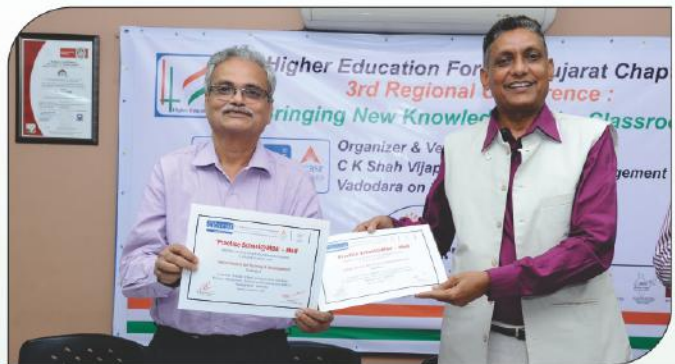
MoU signed with Indian Society for Training & Development