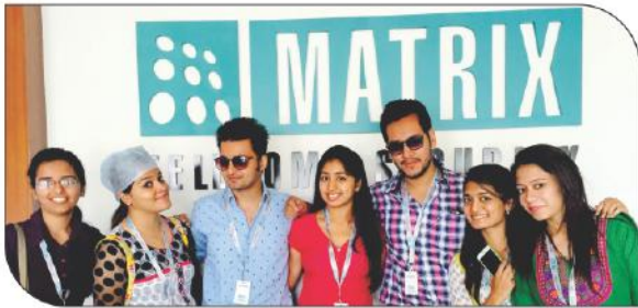
MBA Batch V (2013-2015)