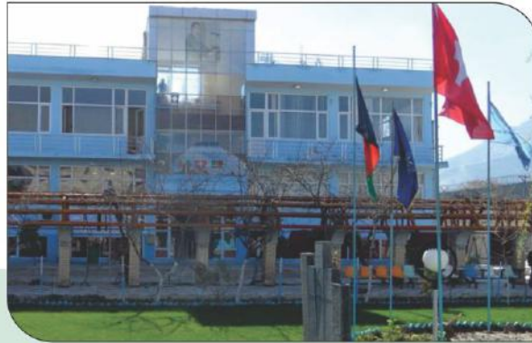
Cooperation with Swiss UMEF University, Geneva, Switzerland for MBA Studies on EU Scholarship - 2016