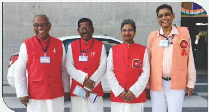
'Practice School' implemented at Gujarat Technological University