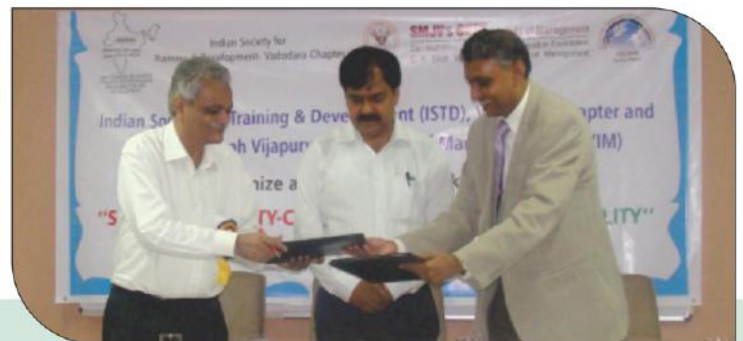
Indian Society for Training & Development (ISTD) along with CKSVIM IIPC organized an Interactive Workshop on 'SKILL-GAP REALITY-CHECK...INCREASING EMPLOYABILITY' on 24th August 2013