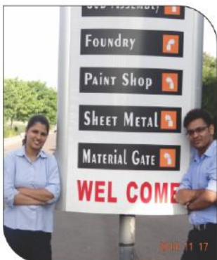
MBA Batch V (2013-2015)