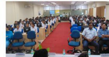
Workshop on "Introduction to MATLAB"