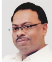
Hon'ble Shri. Chandrashekharji Bawankule MLA, Kamptee, Minister of Energy & New Renewable Energy, Maharashtra State