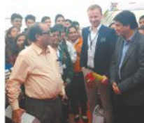
Students interacting with Director, Infosys at 19th National Conference on e-Governance