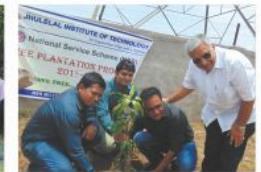
Tree Plantation by NSS & Rotaract Club