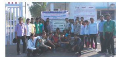
JIT students at Kakrapar Atomic Power Station, Gujarat