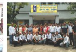
Visit to 'Home for Aged & Handicapped'