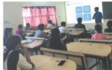
SEB's Workshop for enhancing financial skills