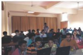
Workshop on "Ethical Hacking" as a Career Option