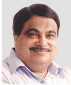
Hon'ble Shri. Nitinji Gadkari Union Minister for Road Transport and Highways and Shipping, BJP