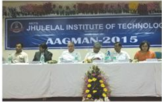
BE First Year