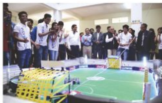
Robo Soccer Competition