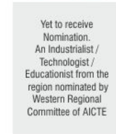
Yet to receive Nomination. An Industrialist / Technologist / Educationist from the region nominated by Western Regional Committee of AICTE