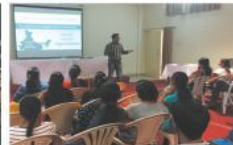
Vidarbha Industries Association Marketing Workshop