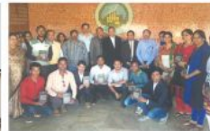
STTP on 'Managing People & Global Career: The Changed Challenge'