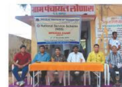
NSS Camp at Lonara