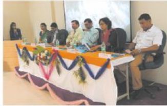
MBA - First Year