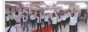
Gain Confidence, Reduce Fear: Self-Defense Workshop for Women