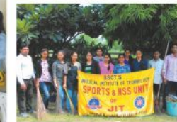
"Swachha Bharat Abhiyan"