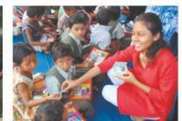
Nail Cutter Distribution & Health Awareness Program