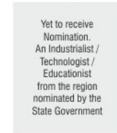
Yet to receive Nomination. An Industrialist / Technologist / Educationist from the region nominated by the State Government