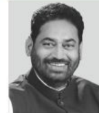
Shri. Nitin Raut Ex-Cabinet Minister Govt. of Maharashtra