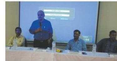
Power Plant Familiarization Workshop