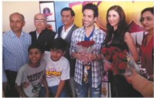
Tushar Kapoor & Claudia Ciesla