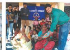
Joy of giving