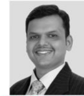
Hon'ble Shri. Devendra Fadnavis Chief Minister, Maharashtra (nominated by trust)