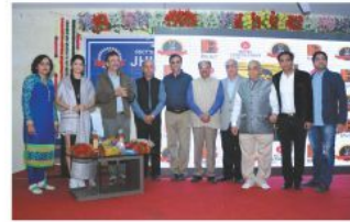
Rajkumar Hirani, Director