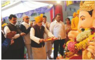
Hon'ble Devendraji Fadnavis & Chandrashekharji Bawankule seeking blessings during Ganeshotsav