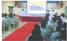
Stress Management Workshop