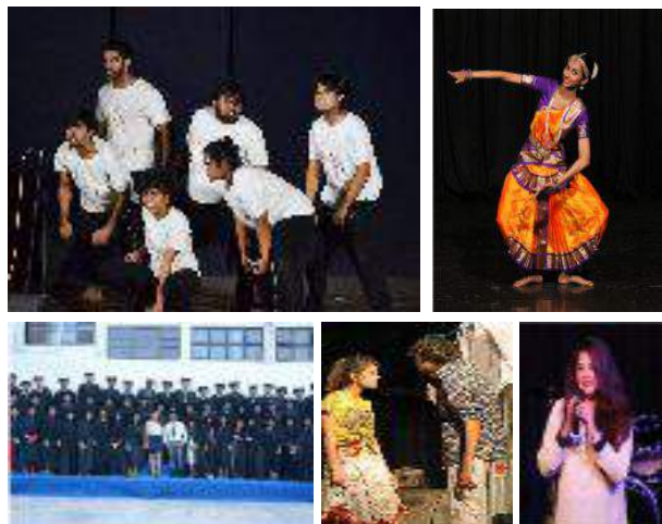
Student Council's Activities

The college has constituted a Students' Council with Principal as Chairman, one Faculty is nominated by Principal, as in-charge, NCC officer, NSS programme officer, one meritorious student from each class and outstanding students from NSS, DLLE, SPORTS, NCC, Cultural activities and two girl students nominated by the Principal. The tenure of the Students' Council is one academic year. It organises, supervises and co-ordinates the activities of different Students' Associations, societies and also makes recommendations to appropriate authorities regarding matters related to the welfare of the students. These include conveying genuine grievances of the students.