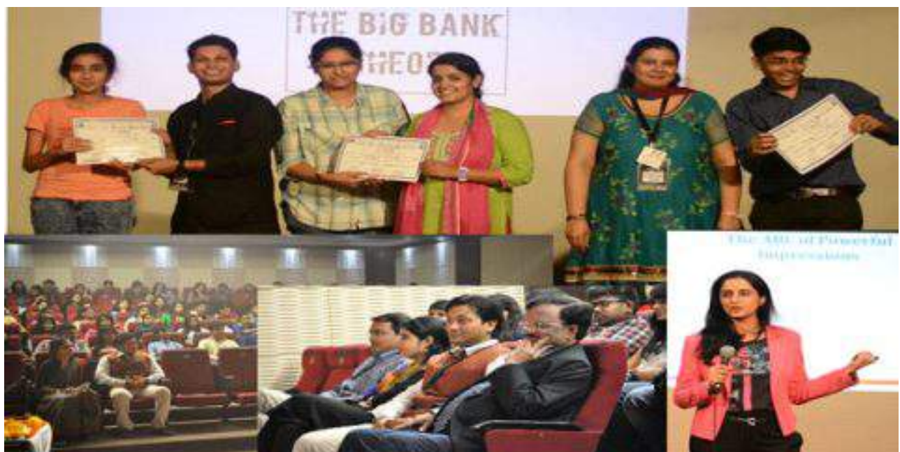
Big Bang Theory Event - Image Management, GD, Workshops, Games & Quiz...