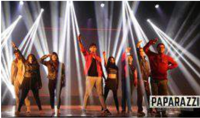
Paparazzi is the name of Mithibai's Media Festival.