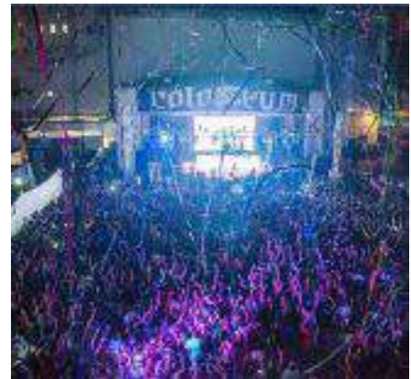
COLOSSEUM - BMS INTER-COLLEGIATE FESTIVAL