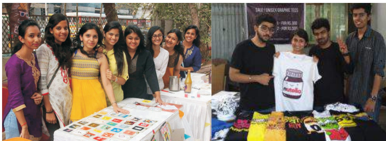
BMS Students practicing Entrepreneurship by setting up Business Units in Mithibai Admission Area.

Three years of the course at Mithibai makes students confident, develop their communication skills, and leave them ready to adapt themselves to the outside world. Our students have won accolades in many spheres, ranging from literature, cultural activities, and sports to academics. This, and the practical learning process our department is now renowned for, ensures that our students land even the best of the internships, such as with the Reserve Bank of India.