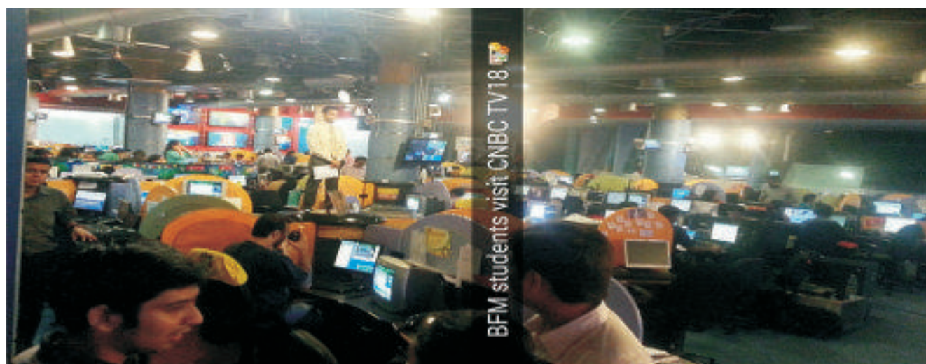
BFM STUDENTS VISIT CNBC TV18