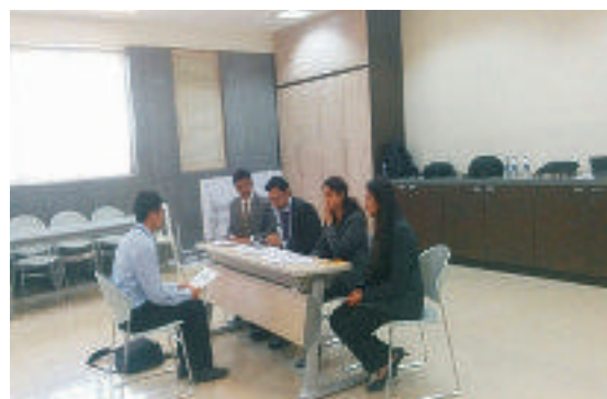
GDPI & Interview SESSION during Placements

We have offered our students an opportunity to participate in group discussion, pre-placement talks and more than 60 companies visited the campus since 2012-2013 & have made offers to our graduating students after the third year examinations. Following are the top recruiters.