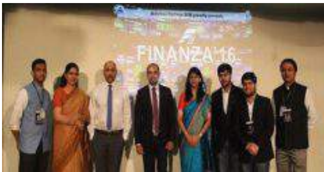
Mithibai BFM Festival – Finanza 16