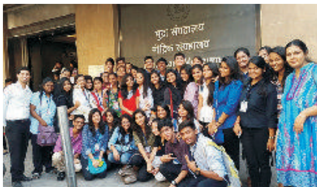
SYBBI STUDENTS Visit at RBI

Our students have won accolades in many spheres, ranging from literature, cultural activities, and sports to academics. This, and the practical learning process of our department is now renowned & ensures that our students land with the best of the internships, such as with the RBI. For high achievers and committed students, Mithibai BBI is a 'preferred' choice.