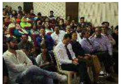
Juhu Jagruti Hall