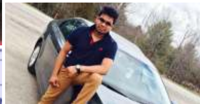
Dekate Trushenkumar Canada