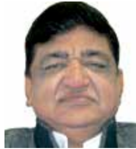
Shri Naresh Agarwal Executive Council Member M.P., Rajya Sabha