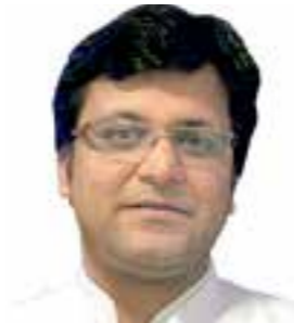
Shri Nitin Agarwal Executive Council Member Minister of State (Independent Charge) MSME and Export Promotion U.P. Govt.