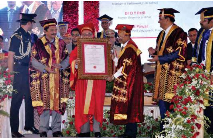
Conferring the degree of Doctor of Science (Honoris Causa) on Shri. Abhijit Mukherjee Member of Parliament (Lok Sabha)