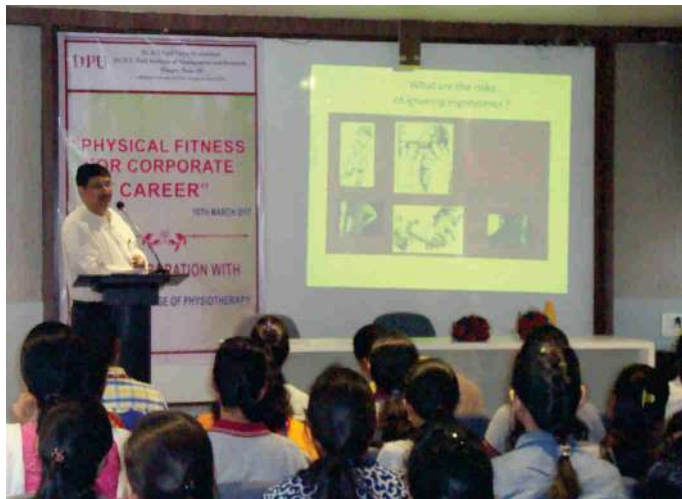
Staff invited as Resource Person

Various camps are regularly organized by the College for the community like blood donation camps and free Physiotherapy camps.