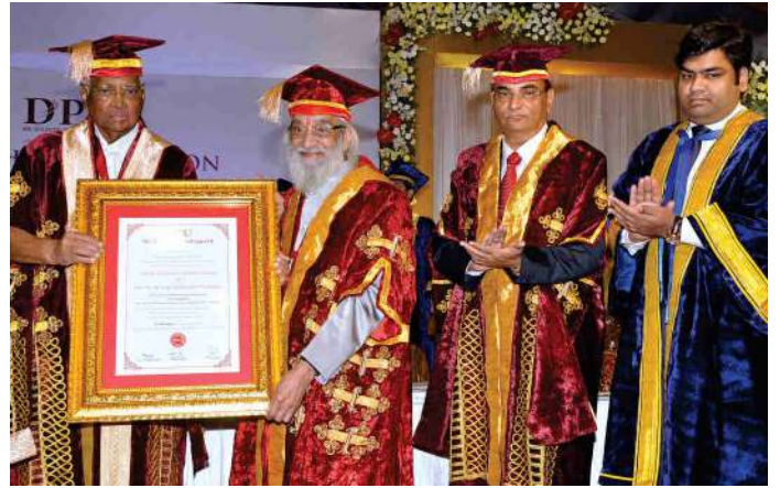
Conferring the degree of Doctor of Letters (Honoris Causa) on Shri. B. M. alias Babasaheb Purandare , Eminent Historian and play-writer