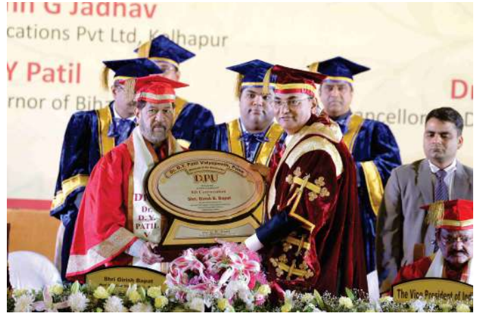
Felicitation of Shri. Girish Bapat Hon'ble Guardian Minister, Pune