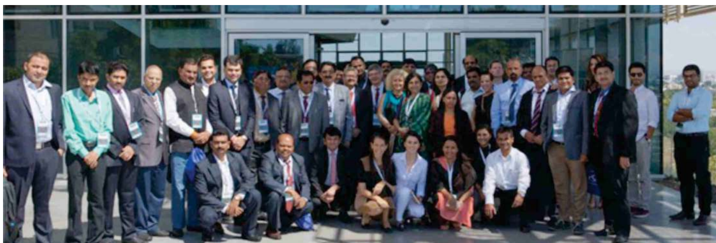
An International Conference by EDUCON at Israel.