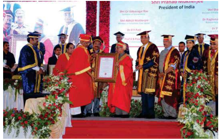
Conferring the degree of Doctor of Letters (Honoris Causa) on Shri. Sharad Pawar, Member of Parliament (Rajya Sabha)