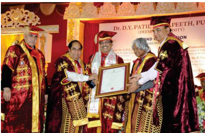
Conferring the degree of Doctor of Letters (Honoris Causa) on Advocate Ujjwal Nikam , Special Public Prosecutor, Government of Maharashtra