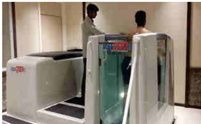
Under Water Treadmill (Aquaciser)