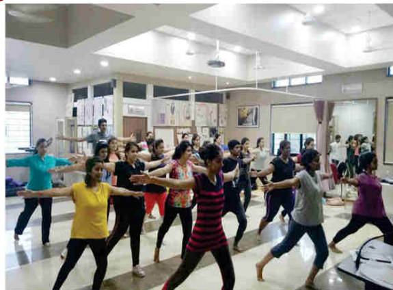
Aerobic Training Workshop