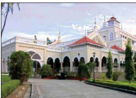
Aga Khan Palace