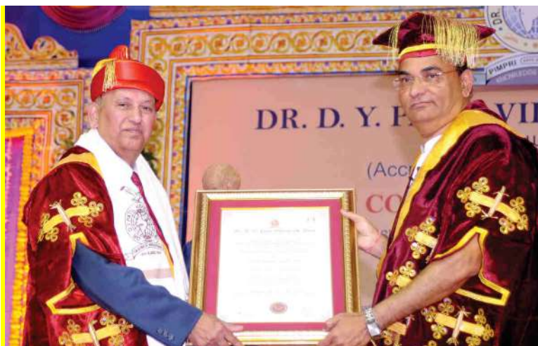
Conferring the degree of Doctor of Science (Honoris Causa) on Prof. U. R. Rao Former Chairman, Indian Space Research Organization (ISRO)