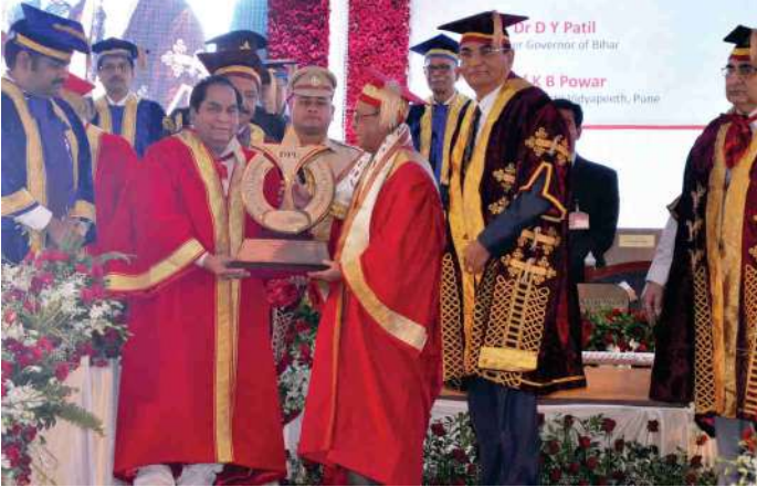
Felicitation of Chief Guest Hon'ble Shri. Pranab Mukherjee, President of India