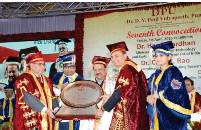
Felicitation of Chief Guest Dr. Harsh Vardhan, Minister of Science and Technology and Earth Sciences Government of India