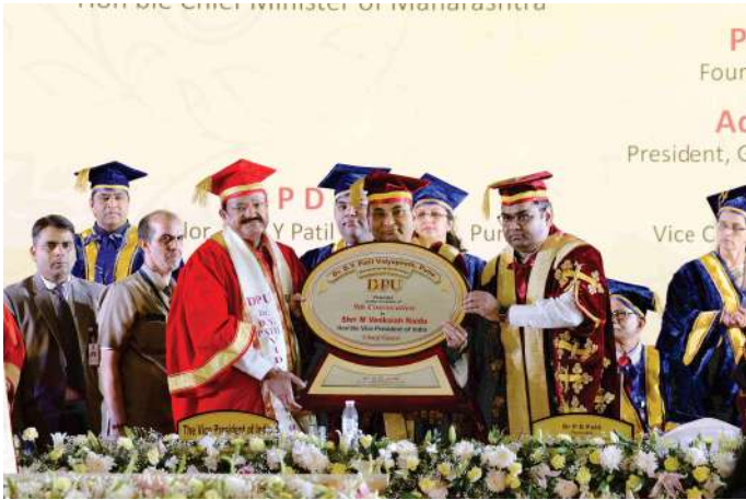
Felicitation of Chief Guest Shri. M. Venkaiah Naidu, Hon'ble Vice President of India