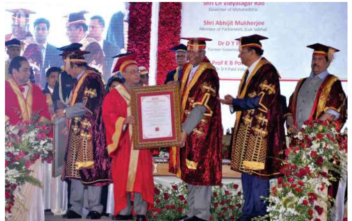
Conferring the degree of Doctor of Science (Honoris Causa) on Dr. Raghunath Mashelkar National Research Professor