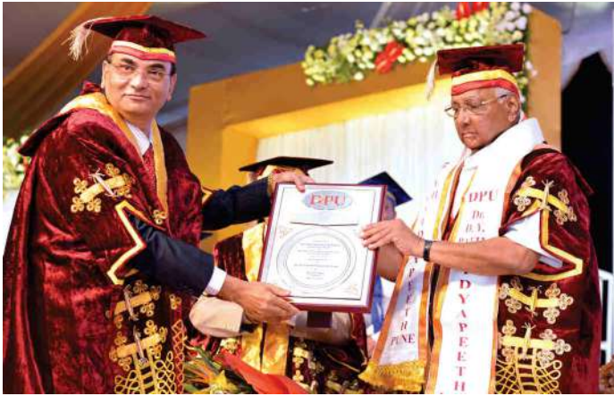
Felicitation of Chief Guest Shri. Sharadchandra Pawar , The then Union Minister of Agriculture & Food Processing Industry, Government of India