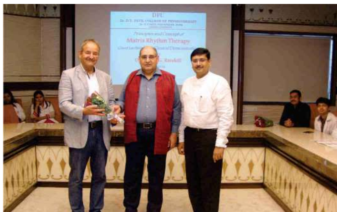
CPE on Matrix Rhythm Therapy