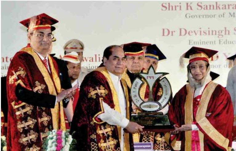
Felicitation of Chief Guest Smt. Pratibha Devisingh Patil, President of India