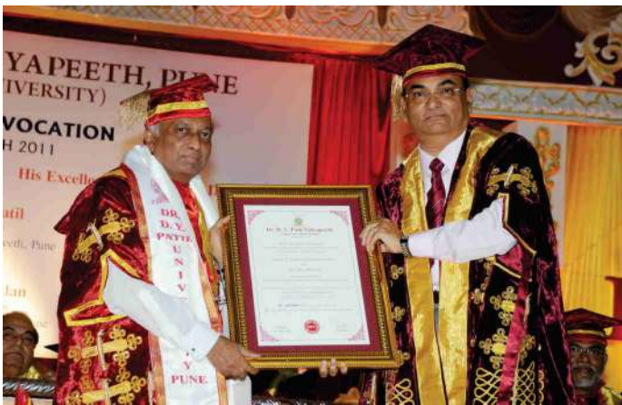
Conferring the degree of Doctor of Science (Honoris Causa) on Dr. Vijay Bhatkar , Chairman, ETH Ltd. and former Director CDAC