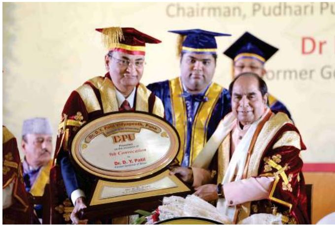
Felicitation of Dr. D. Y. Patil Former Governor of Bihar