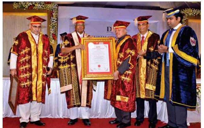
Conferring the degree of Doctor of Science (Honoris Causa) on Prof. M. S. Swaminathan , Eminent Agricultural Scientist