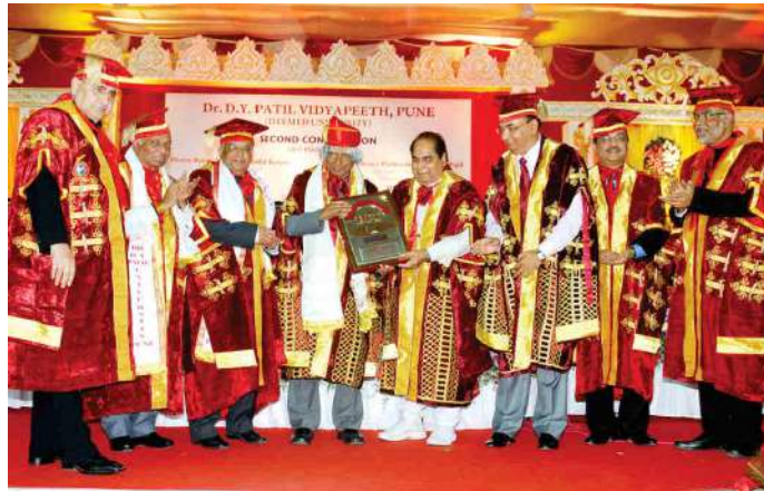
Felicitation of Chief Guest Dr. A. P. J. Abdul Kalam , Former President of India