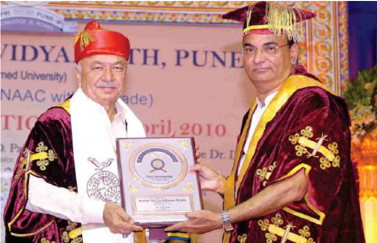
Felicitation of Chief Guest Shri. Sushilkumar Shinde The then Union Minister of Power; Government of India