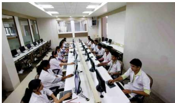
Wi-fi Enabled Campus