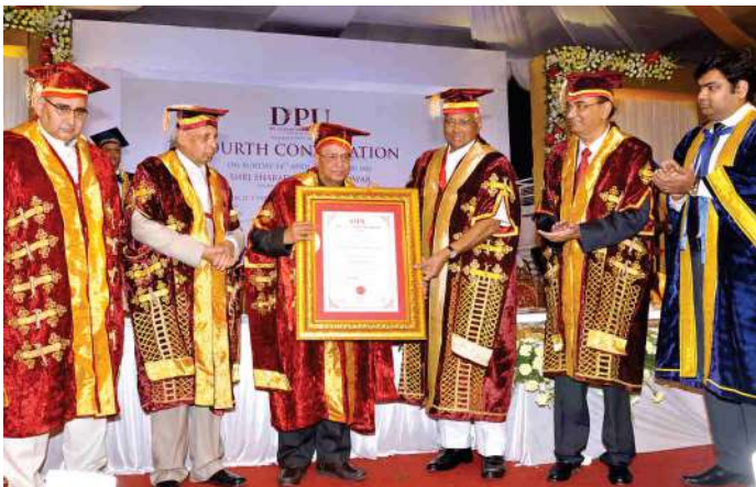
Conferring the degree of Doctor of Science (Honoris Causa) on Dr. Krishnaswamy Kasturirangan , an Architect of India's Space Research Programme