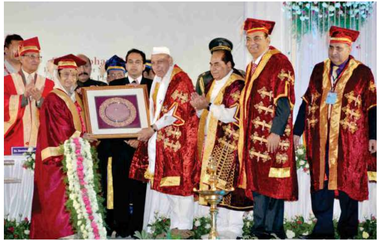
Conferring the degree of Doctor of Letters (Honoris Causa) on Shri. Montek Singh Ahluwalia, Deputy Chairman, Planning Commission, Government of India