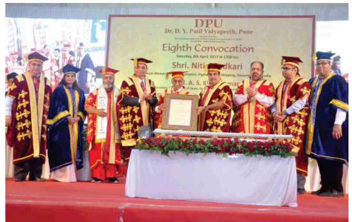
Conferring the degree of Doctor of Science (Honoris Causa) on Shri. A. S. Kiran Kumar , Secretary, Department of Space, Government of India and Chairman (ISRO)