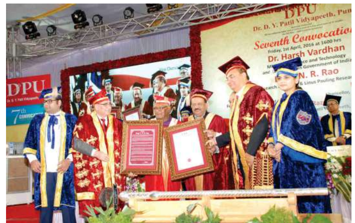
Conferring the degree of Doctor of Science (Honoris Causa) on Dr. C. N. R. Rao, National Research Professor & Linus Pauling Research Professor