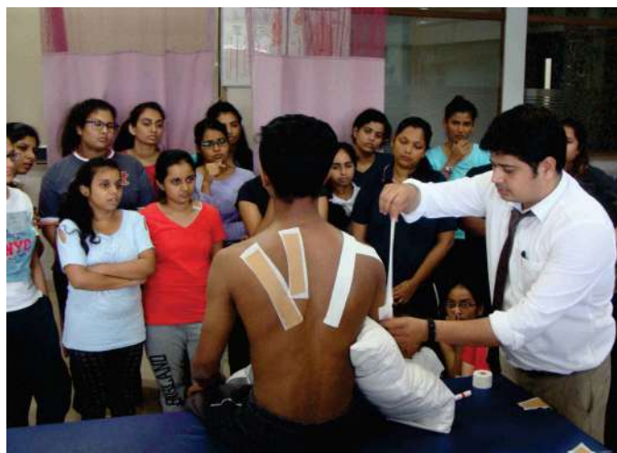
Therapeutic Taping Workshop