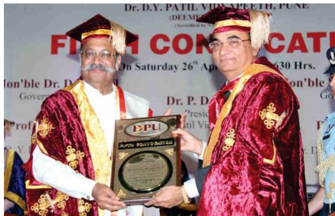
Felicitation of Chief Guest Hon'ble Shri. Shrinivas Patil Governor of Sikkim, India