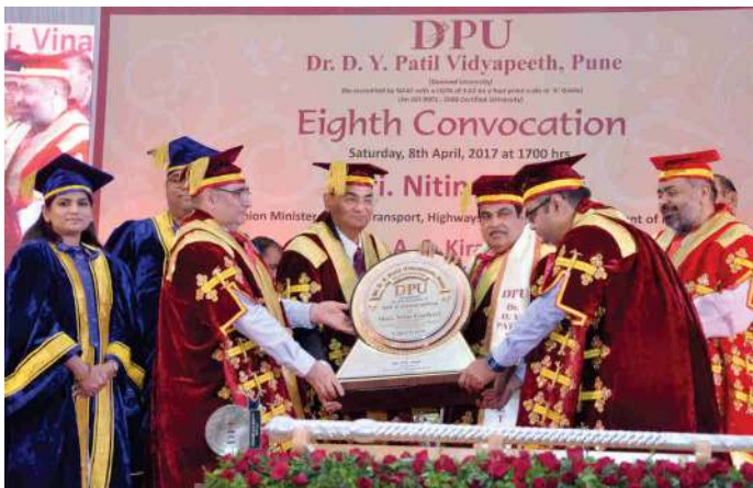
Felicitation of Chief Guest Shri. Nitin Gadkari , Union Minister of Road Transport, Highways and Shipping, Government of India