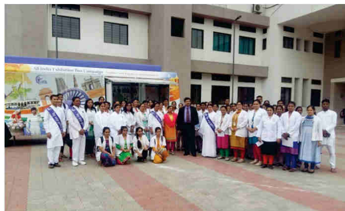
National campaign on "MERA BHARAT SWARNIM BHARAT"

The student council organized various functions and cultural activities including planning co-ordinating and executing 'SPARSH' the annual social gathering and cultural event of the college. They also arrange sports & other cultural competitions with the help of students' council. The college arranges many extra curricular and personality development activities.