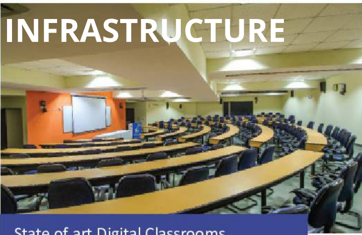
State of art Digital Classrooms