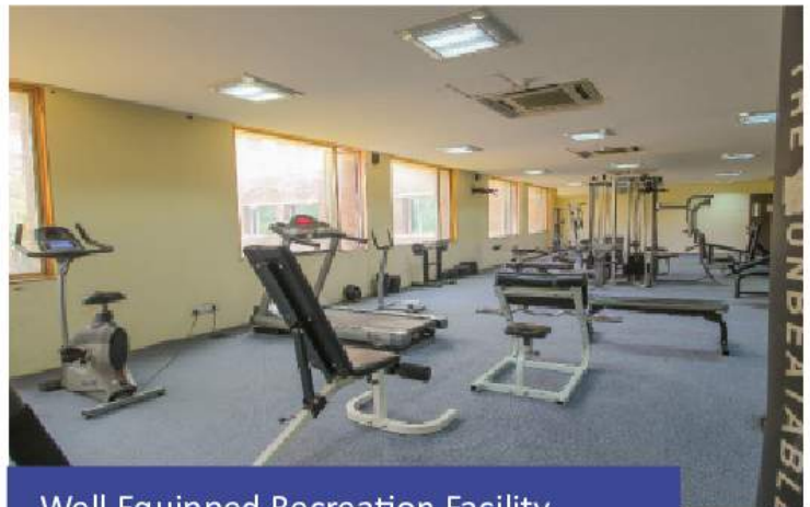
Well Equipped Recreation Facility