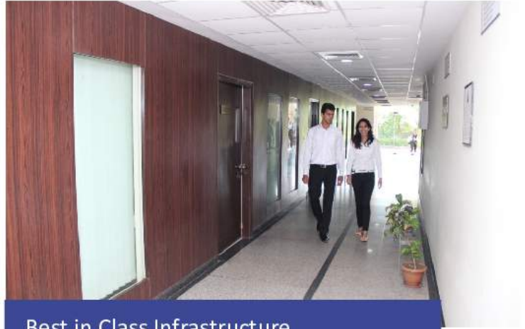
Best in Class Infrastructure