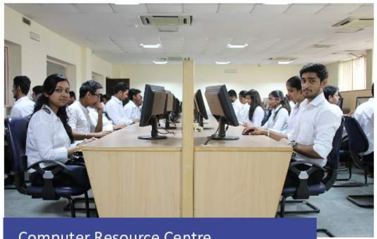
Computer Resource Centre