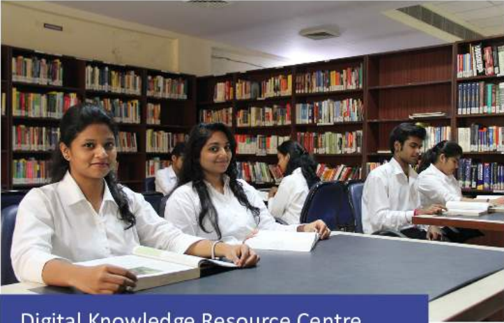
Digital Knowledge Resource Centre