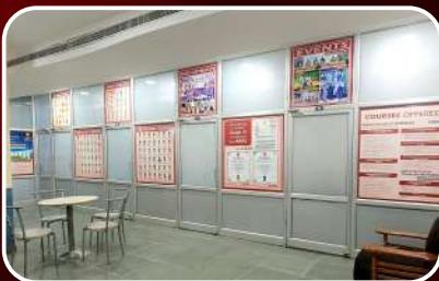
Admission Cell 2