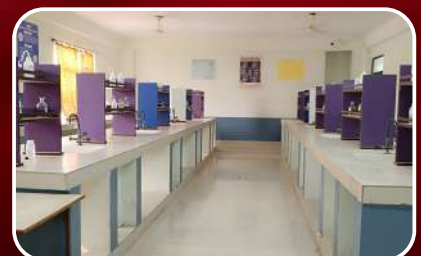
Pharmaceutical Chemistry Lab