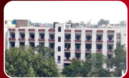
Boys' Hostel 2