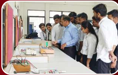
Electrical Lab 2