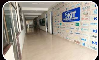
Placement Cell 2