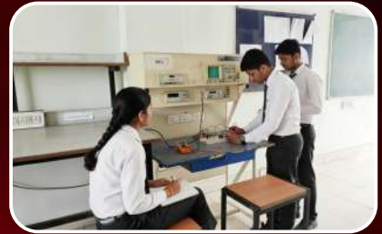
Electronics Lab 1