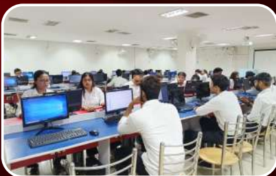
Computer Lab 1