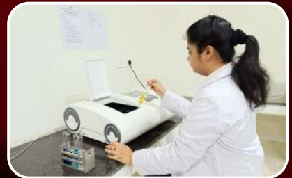
Biotechnology Lab 2