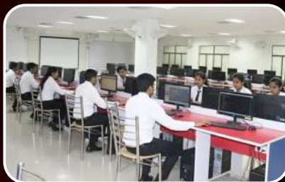
Computer Lab 2