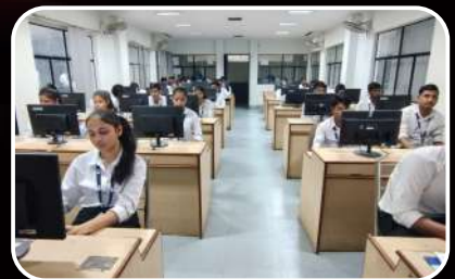
Computer Lab 3