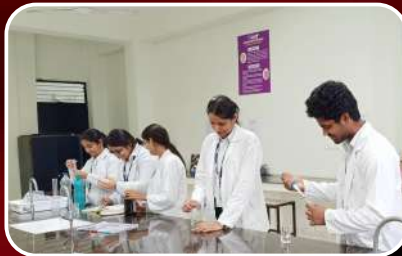
Biotechnology Lab 1