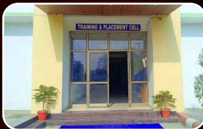
Placement Cell 1