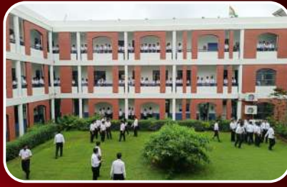
Academic Block 2