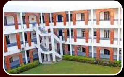
Academic Block 3