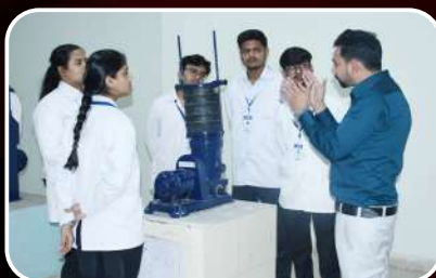
Sieve Shaker Machine