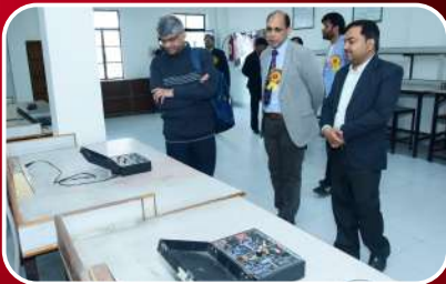
Electronics Lab 2