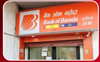
Bank & ATM