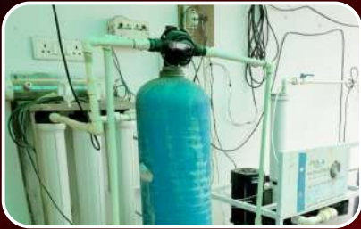
RO Water Plant