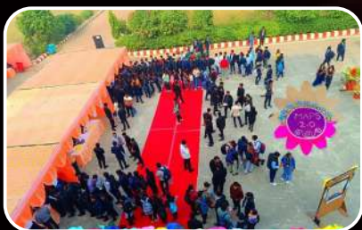
International Conference Maps 2.0