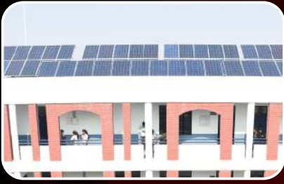
Solar Panel 1