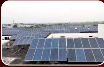
Solar Panel 2