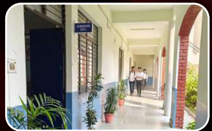
Admission Cell 1