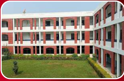
Academic Block 1