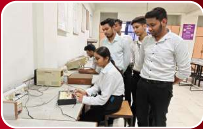
Electrical Lab 1